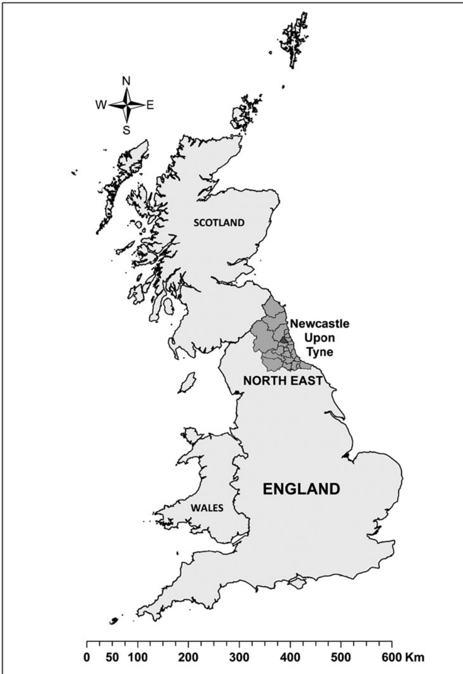
Figure 1. Map showing the location of the North East region of England.