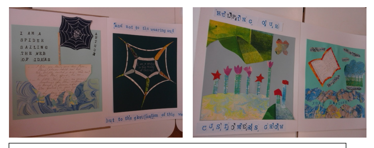
Two sections of the artwork made by Workshop 3 participants in Layers Upon Layers.

Throughout the process, the staff were agog to see what subsequent groups would make of their creations, and were frequently struck by their own sense of common purpose, shared across all teams. The work they made, and the stories they shared during workshops of their interactions with customers, articulated and gave form to this shared resolve.