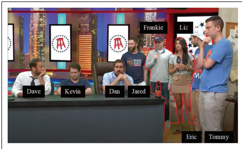
Figure 1. Configuration of panellists before the accusation 2 .