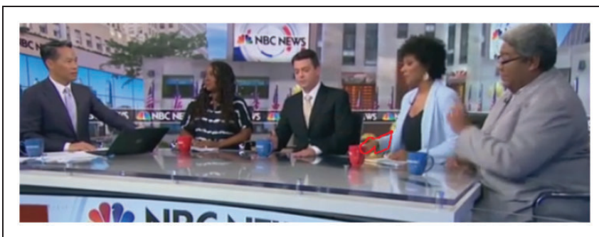
Figure 2b. Zerlina retracts her hand.