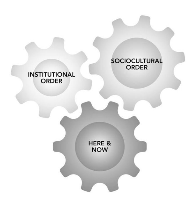
Figure 2. Unpacking multilingualism in the modern workplace (Angouri and Piekkari, 2017)

context. The framework therefore is useful for our analysis of local talk about language problems, and the dynamics of the ways interactants operate at the interface of these three orders. To capture linguistic resources (e.g. categories and shared assumptions) available to and mobilised by participants, we pay close attention to recurring discourse patterns within and across the interviews, which were also observed in the ethnographic fieldwork (De Fina, 2013). In the next section, we discuss our findings on the construction of language problems.