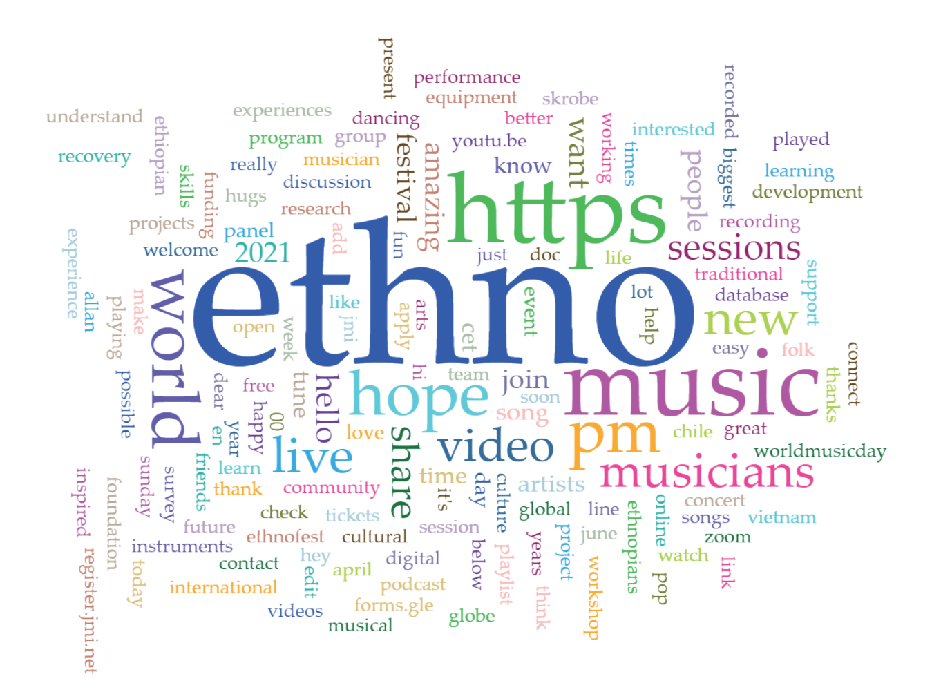
Figure 5.3: Word Cloud for Ethno Forever

Note: Generation based on 3% frequency cut-point (of 5012 total words).