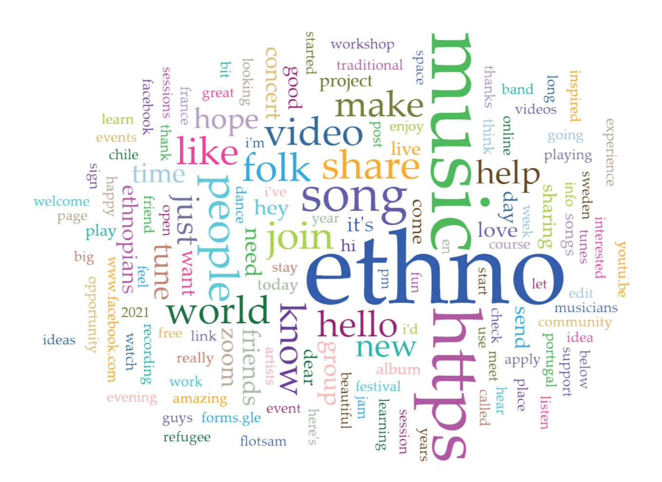
Figure 5.2: Word Cloud for Ethnopia

Note: Generation based on 1% frequency cut-point (of 13,585 total words).