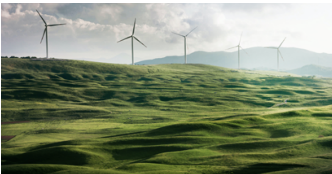
Photo 'Valley of windmills' by Appolinary Kalashnikova @ Unsplash ( https://unsplash.com/photos/WYGhTLym344 )

We tested the utility of the CriSS Tool within a one-day workshop with 26 delegates