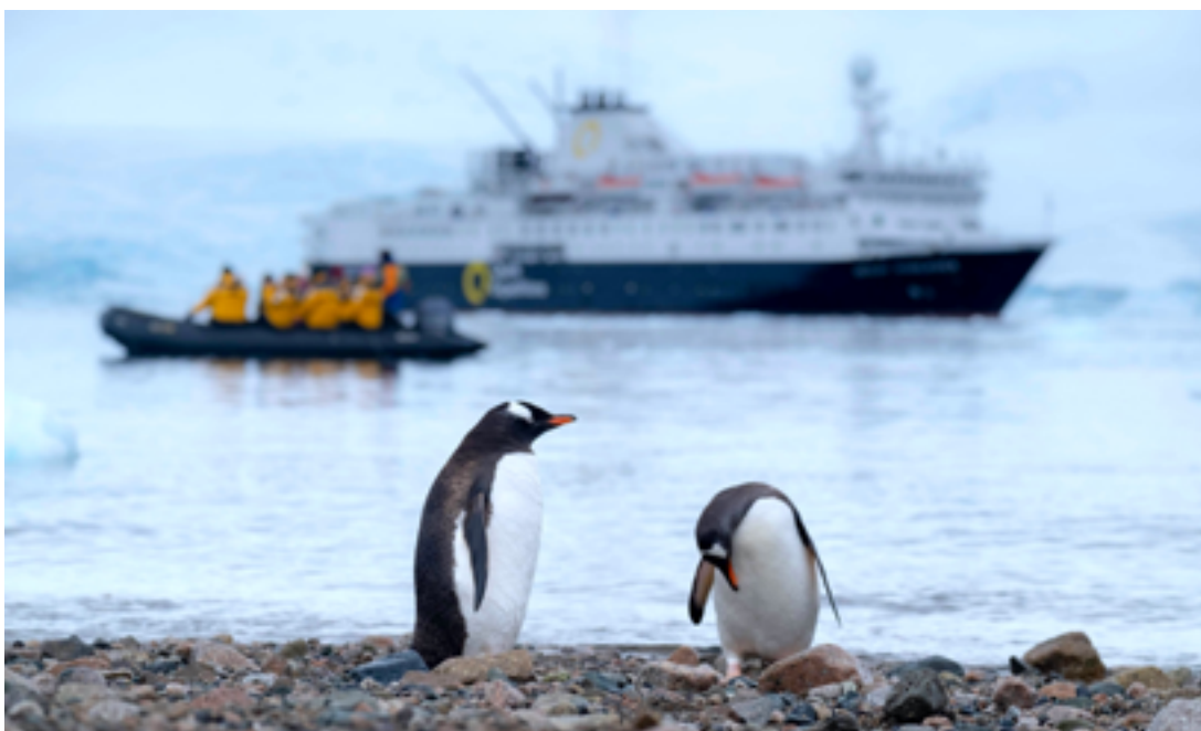
Photo of Gentoo penguins on a stony beach on Danco Island (Antarctic Peninsula). Quark Expeditions ship in the background.

development of almost any kind of creative content including, but not limited to, short films, advertisements, digital applications, immersive experiences, theatre, radio broadcast, internal and external organisational communications, or in the communication of heritage stories. By reflecting on how to answer the questions within each of the six themes, users will grow their global challenge literacy by iteratively and progressively building their knowledge and understanding of sustainability transformation and the climate emergency. It is important to note, we are not asserting a particular method of storytelling about climate change and sustainability. Instead, we are seeking to refine the skills and knowledge of creative industry storytellers by providing a route for translating evidence-based research into stories in a reflective, informed manner that extends the critical thinking within the stories told and the quality (defined as rigor and usefulness) of the information conveyed.