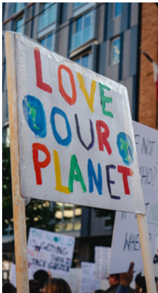
Photo 'Love our planet signage' by Ronan Furuta @ Unsplash ( https://unsplash.com/photos/sp_pcgjPvgI )

The remainder of this report presents the route to achieving these objectives and the key project outcomes. The next section provides an account of the methodological approach we pursued to achieve these goals. This is followed by an explanation of the principal findings of the project, namely the Sustainability Content Evaluation Tool and Critical Sustainability Stories (CriSS) Tool which was designed to support communicators in the development of sustainability and climate change stories and creative content. Guidance notes on how to use and implement the CriSS Tool are available to communicators as an accompanying document to this report.