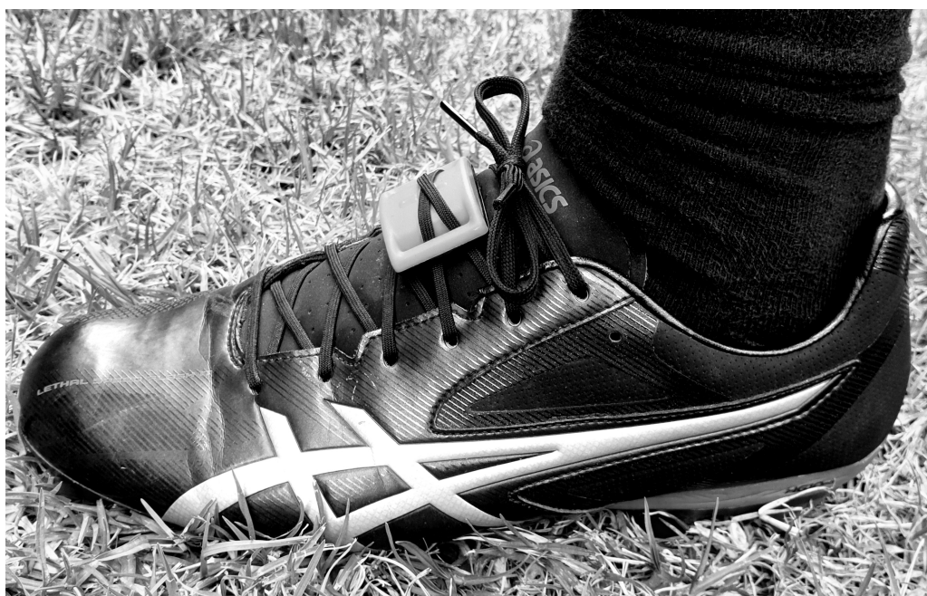
Figure 1 Accelerometer placement on boots.