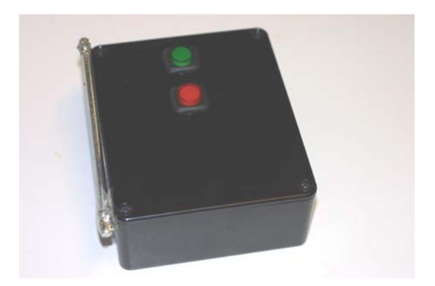
Figure 3. Custom-made navigation device.

They held the wireless device allowing for backward/forward translational movement in the direction of the head-tracked movement. Restrictions of navigation applied were based on collision detection and boundaries of head movements. The exposure time was 120 seconds. Idle time, direction of idle time as well as navigation routes were monitored through software during exposure.