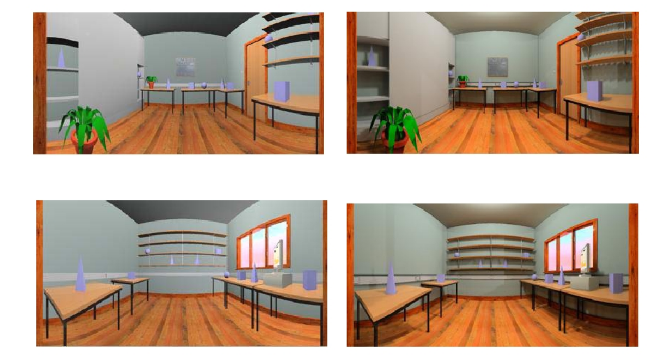
Figure 1. Flat-shaded rendering (first column), radiosity rendering (second column) of the experimental space consisting of two interconnected rooms.