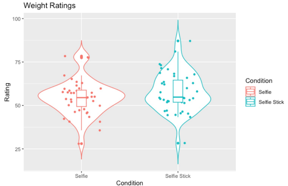
Fig 6. Violin plots with box plots and data points showing weight ratings across selfies and selfie-stick images.

https://doi.org/10.1371/journal.pone.0291987.g006