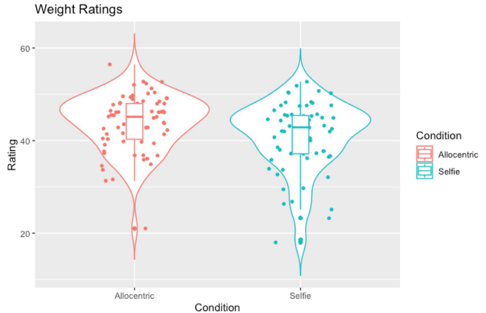
Fig 2. Violin plots with box plots and data points showing weight ratings across selfies and allocentric images.

https://doi.org/10.1371/journal.pone.0291987.g002