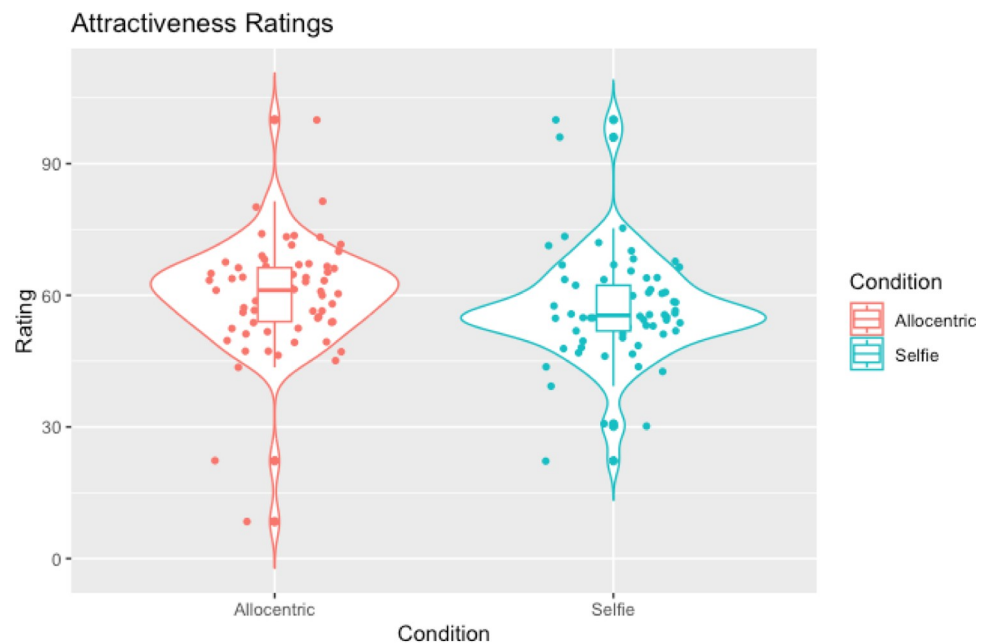
Fig 3. Violin plots with box plots and data points showing attractiveness ratings across selfies and allocentric images.

Similarly for the attractiveness ratings, there was no significant correlation found between attractiveness differences and Restriction scores. However, there were significant correlations between attractiveness differences and Shape and Weight Concern scores and between attractiveness differences and Preoccupation and Eating Concern scores (see Table 3), such that greater SWC and PEC scores were related to greater attractiveness ratings for selfies compared