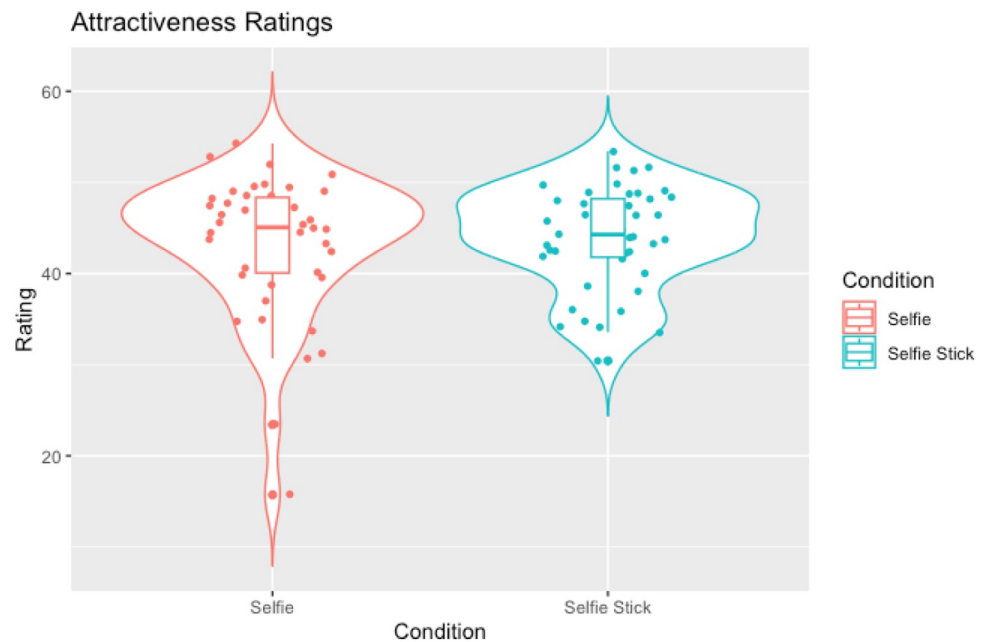
Fig 7. Violin plots with box plots and data points showing attractiveness ratings across selfies and selfie-stick images.

We calculated means and standard deviations of WHR in the selfie ( M = 0.91 , SD = 0.54 , range = 0.84–1.03) and selfie-stick ( M = 0.83 , SD = 0.05 , range = 0.74–0.97) conditions. In line with the hypothesis that WHR would be related to attractiveness ratings, differences in WHR measured between the two types of images were significantly correlated with attractiveness