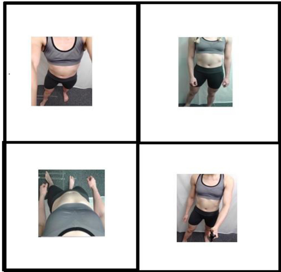
Fig 1. Example stimuli: Selfie (top left), allocentric (top right), egocentric (bottom left), and selfie-stick (bottom right) perspectives.

https://doi.org/10.1371/journal.pone.0291987.g001