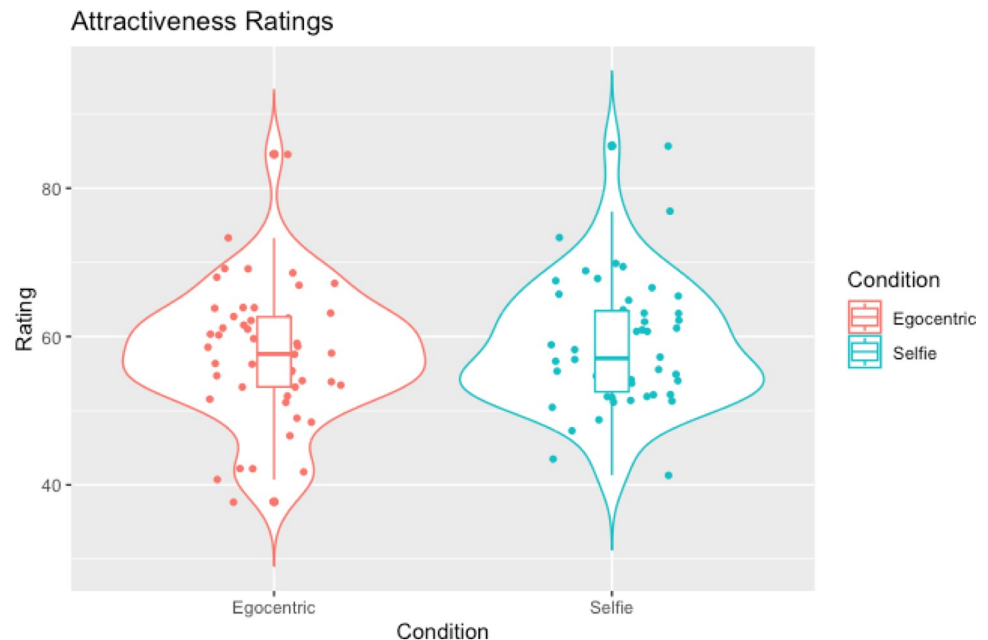
Fig 5. Violin plots with box plots and data points showing attractiveness ratings across selfies and egocentric images.

https://doi.org/10.1371/journal.pone.0291987.g005