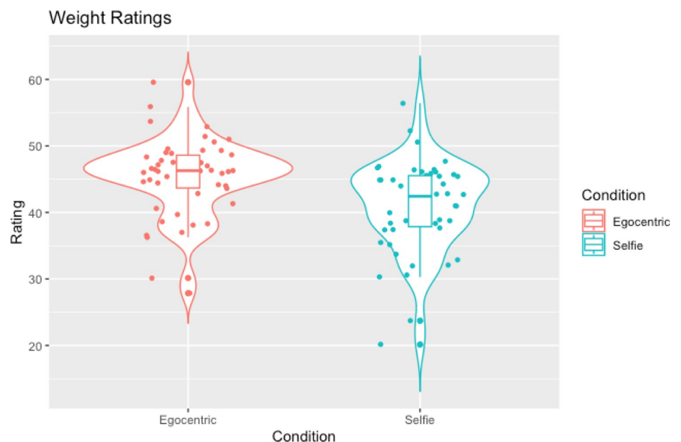
Fig 4. Violin plots with box plots and data points showing weight ratings across selfies and egocentric images.

Experiment two (Selfie vs egocentric) discussion. Selfies were judged to be both more attractive and slimmer than bodies photographed from an egocentric perspective, however there were no significant correlations between these differences in aesthetic judgements and disordered eating thoughts and behaviours. This contrasts with experiment one, in which