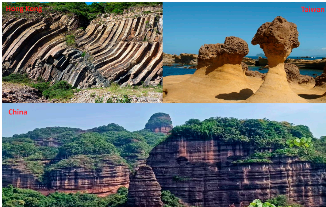
Figure 2. Geoparks in Hong Kong, Taiwan, and Guangdong, China.

The present study selects three geotourism destinations, including Danxiashan UNESCO Global Geopark (DXGP) in the southern region of China, Hong Kong UNESCO Global Geopark (HKGP), and Yehliu Geopark (YLGP) located on the northern coast of Taiwan (Figure 2). These geoparks have been officially designated as geotourism destinations owing to their exceptional geological and geomorphological attributes that have been attracting a high volume of tourists [5,7].