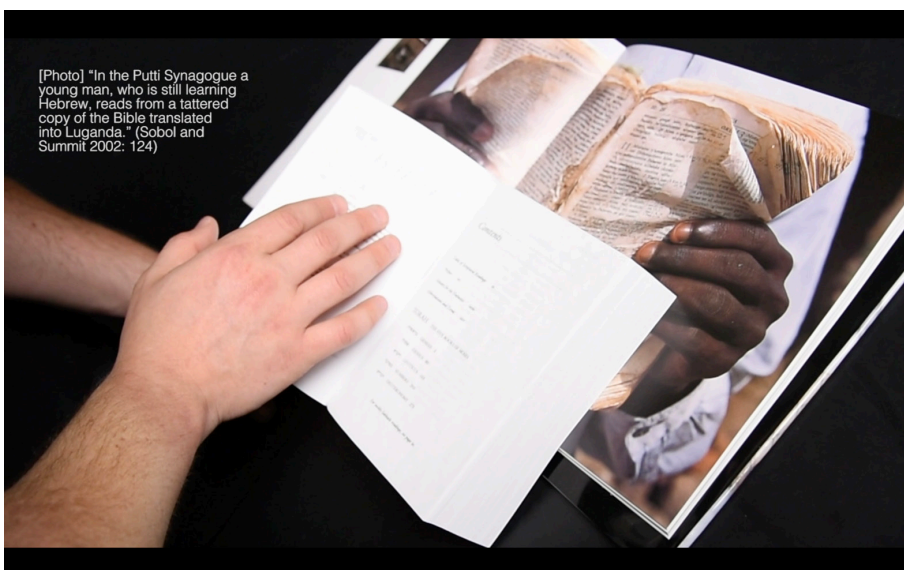
[Photo] "In the Putti Synagogue a young man, who is still learning Hebrew, reads from a tattered copy of the Bible translated into Luganda." (Sobol and Summit 2002: 124)