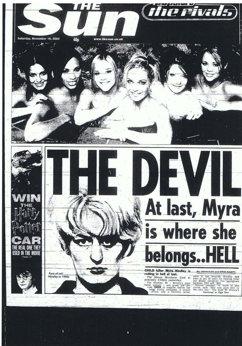
Fig. 4: The Sun's report of Myra Hindley's death (16 November 2002).

Carolyn Steedman and Allan Sekula have both cited the emergence of photographic representation in the mid-nineteenth century as fundamental to ways of looking at working class childhood. Steedman makes the link between the construction of working class childhood as “beauty in sordid surroundings, [ . . . ] an already thwarted possibility” (66) and the documentary photographic representations in which specific children were represented as such: “this literal depiction of working-class childhood was connected to the emergence of photography as a means of representation” (65). Sekula has noted how photography allowed