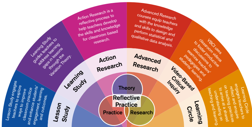
Figure 9.1: Critical enquiry courses offered by the Academy of Singapore Teachers