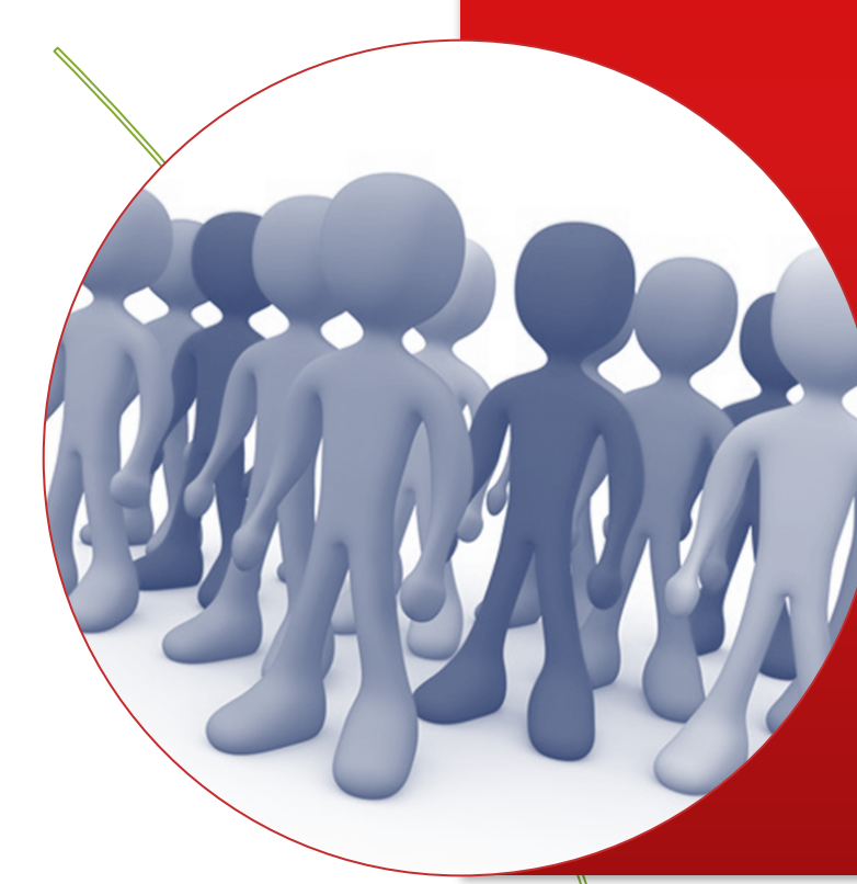
Figure 2: Study Characteristics