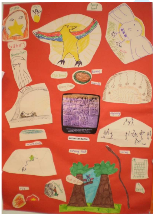
Figures 2 and 3. Example artefacts from storytelling workshops: a poster retelling the Sumerian myth of Lugalbanda, and a class poem written on the York experience of bubonic plague.

So as to elicit the pupils' observations as to the characteristics of storytelling-based learning, we invited volunteers from the three classes to join us for a loosely structured focus group discussion (18 th March 2015). The nine pupils that chose to come (three per class) were, unsurprisingly, among those who had shown greatest interest in storytelling and developed most as storytellers during our collaboration. We sat around a table covered with all the artefacts that the three classes had collectively produced based on stories during almost two years of our collaboration, for example: