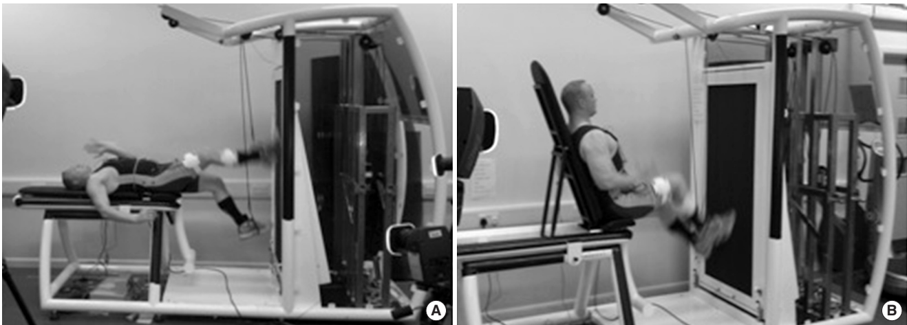
Fig. 1. The VertiRun being used in the supine posture (A) and 70° posture (B).

ing the bench angle and fore and aft settings. The overhanging cables are tethered to the ankle and offer resistance to the musculature of the posterior chain (20 N on the uptake of tension, up to 70 N as the leg descends to the lowest point of the treadmill). Therefore, the magnitude of the resistance is dependent on the leg length, leg mass and the lower limb range of motion of the user.