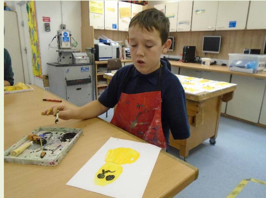
Art – drawing Pokémon