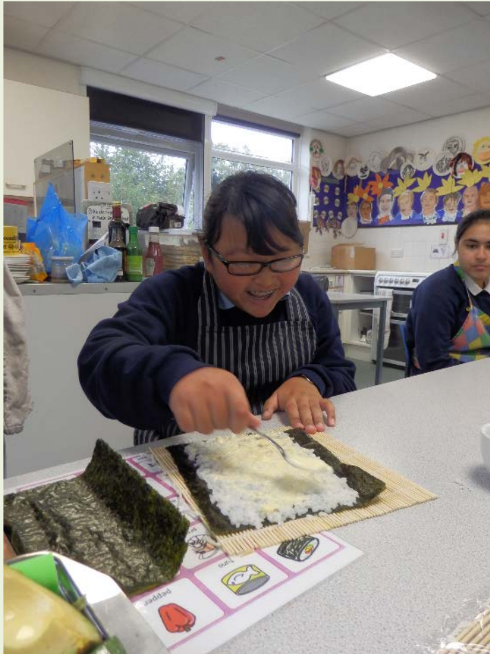
Food tech – making sushi