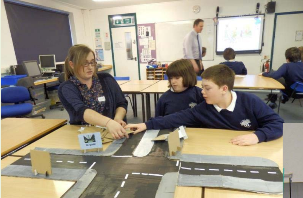
Geography – town planning