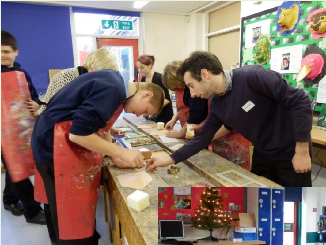
DT – making houses