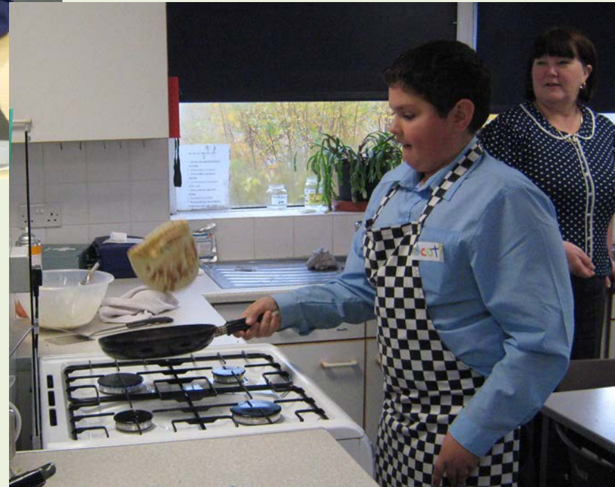
Food tech – making and eating crêpes