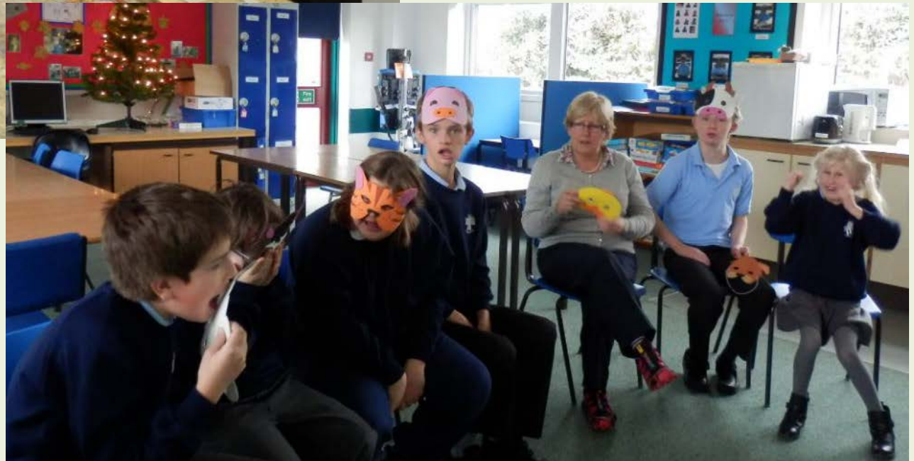
Drama - animals