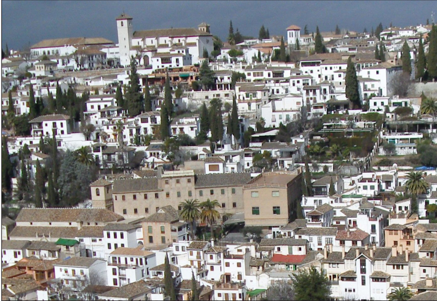
Figure 3: The Albayzín seen from Alhambra. Note the crowd on San Nicolás square, below the church spire on the upper left side. To the right we can see the shorter minaret of the Great Mosque.

heritage discourse' regarding the Albayzín. It is hard to fathom in retrospect the fears voiced by locals back in 1993, that 'the construction of the mosque might have a negative effect on UNESCO's decision to declare the neighbourhood as World Heritage' (Rosón Lorente, 2008: 409). Such concerns were proved unfounded only a year later. The positive decision also disproved the residents' claim that 'the neighbourhood is known for its peasant-Gypsy [ payo-gitano ] ancestry, and the Muslim connotation it might acquire would not be true' (Rosón Lorente, 2008: 408–9). From the perspective of heritagification, the existence of a mosque in what presents itself as a Moorish district brings added value even if the edifice itself is newly built and bears no historical significance.