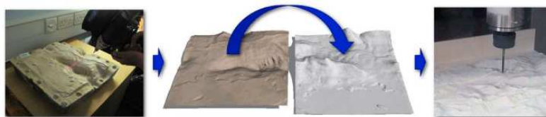
Fig. 2: Digital Reconstruction workflow.

After recovering and cleaning the collection of moulds each item was scanned using a FARO Laser ScanArm V3 and the resulting point clouds tidied within the PolyWorks software. A program was written to convert each point cloud into a form suitable for processing within the ArcGIS Geographical Information System (GIS) package, including the inversion of the vertical dimension. The points were then processed to produce continuous Digital Surface Models from which hillshaded images were derived to assist in locating each mould for the purpose of geo-referencing, as the location and orientation of most of the moulds was not known. From initial processing within the GIS there is some evidence of slight vertical exaggeration when comparing the model against modern elevation data however this will need a full and systematic study and will form part of the ongoing research agenda. Selected tiles were sent to a CMS Athena 5-axis CNC milling machine to produce positive reconstructions of the relevant mould. The generalised workflow is shown in Figure 2.