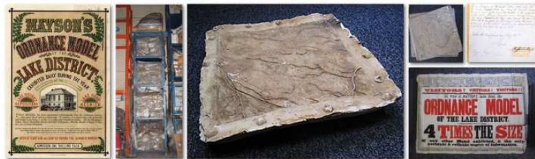
Fig. 1: Remaining archival material relating to Mayson's Ordnance Model of 1875.

The Mayson model was larger and more detailed than others displayed at that time and became a popular tourist attraction. A poster advertising the model reads “ The model has been constructed mathematically from the Ordnance Survey... Parties visiting this model will see the correct topography of the Lake District, and can thereby readily plan either long or short excursions as time will permit. They will also gain a better idea of the whole of the Lake Country than is to be obtained from any other source ”.