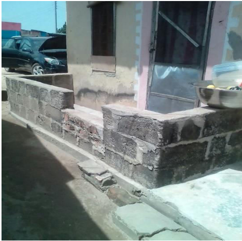
a) A concrete wall constructed to prevent flood from entering the house