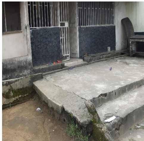
f) Self constructed drainage close to home entrance