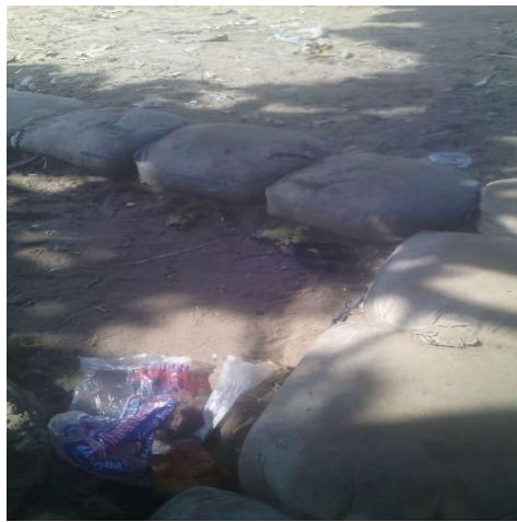
b) Sandbags arranged few meters from building to prevent flood waters