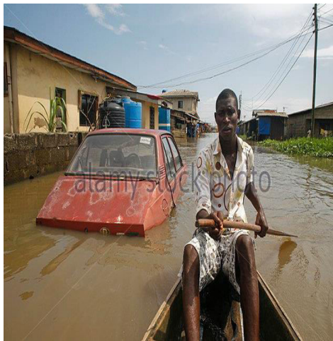
d) Canoe, alternative means of transportation during flood