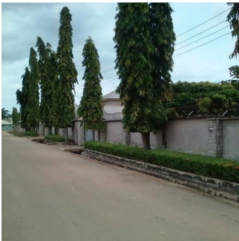
c) Trees planted as a way of adapting to flood