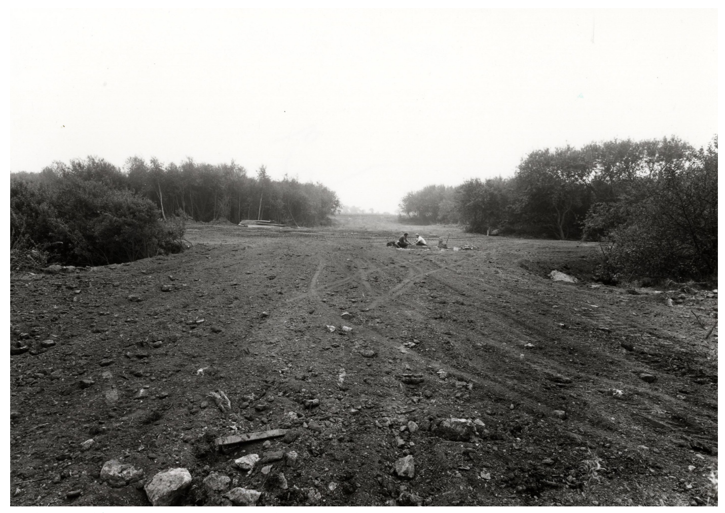
Land prepared for Development Corporation housing in Oakwood, mid 1970s.