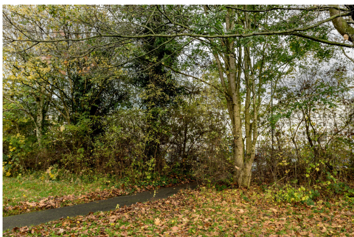
(left) Rutherford House on Birchwood Science Park circa 1978; (right) Photo taken from similar view today

As was the case with all UK New Towns, Warrington's Development Corporation was only ever intended to deliver and manage the new town for its first couple of decades. The management of Birchwood's landscape was ultimately handed over to Warrington Borough Council. Its budgets and priorities were understandably different to those of the Development Corporation, an organisation with the singular purpose of raising land and asset values of the development areas under their control. The urban forest of Birchwood has been left to mature in ways that have left some residents regretful that there hasn't been the close management required to bring out the layers and ultimately the beauty of the woodland landscape.