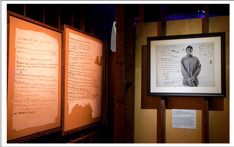
Figure 5. 'Tommie Elton Mabry's Diary', Living with Hurricanes: Katrina and Beyond , Louisiana State Museum, the Presbytère, New Orleans (Authors own image).

encounter with the city. There is a void, a lack understanding, that can never be filled in: 'I've realised that is what I'm doing on this tour. People cannot understand. . . you can't paint a picture, because people. . . they don't realise that water is being churned up like a washing machine. . . they don't realise that houses now have two feet of mud in it. When they were looking for bodies it was months and months afterwards they'd find those bodies' (James). This articulates the limits of personalised narratives – indeed, the limits of language in constructing the traumatic narratives of disaster – and this is foregrounded in the fact that the sharing of the experience is imbued with an individual's emotions and embodied remembrances (Scarles, 2009). James reflected on this and made the following observation: 'actually, this tour was painful. . . I didn't want to do this tour. I really didn't want to do this tour. The reason I did do it is (because) it put me on a bus. It wasn't that I wanted to be doing the tour, but I'd do it well' (James). Similarly, Sylvia shared the intensity of emotion when she visited the Living with Hurricanes exhibition for the first time: 'I don't think half of them (tourists) have seen what this is, but when I went to it [the exhibit] for the first time, I had to leave. I was very emotional, crying. It really just brings back a bad period'.