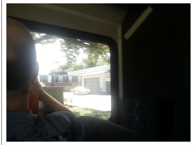
Figure 3. Material traces of water tide lines on gas station in New Orleans through tour bus window, authors own image.