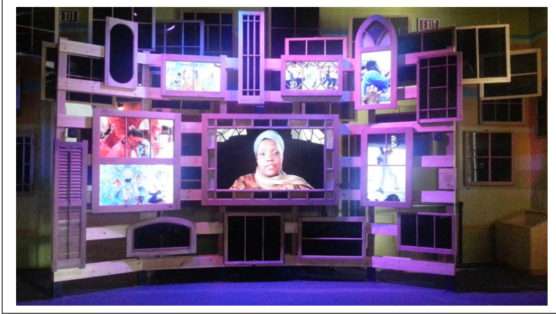
Figure 6. Still of community video installation. Living with Hurricanes: Katrina and Beyond , Louisiana State Museum, the Presbytère, New Orleans.

also includes references to the personal hardship of living without running water or electricity and the two feet of water that flooded the building. His resistance is perhaps best captured in his sense of loneliness and isolation. Taken together, the entries comprise a significant personal story of strength through the experiences and emotional responses to the disaster, a poignant and individual testament that exists alongside the narrative of communal hardship and hope.