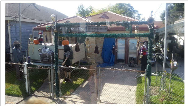
Figure 4. Bartholomew's Jazz Funeral, Authors own image.

the tour guide talks of the boat outside of a museum that ‘rescued 400 people in the Ninth Ward . . . we brought them on the streets, rescuing people off the streets’ (Sylvia). Tour guides also speak about the jazz funerals and personal collections of Katrina debris that were amassed and displayed by Bartholomew in his garden near the Musicians Village (see Figure 4), as well as taking tourists to the many overgrown vacant lots where homes existed before the disaster. As James remarked, ‘you could say those water lines and different buildings are memorials’, and they remain ghostly presences in the city, where many lives were taken by the high water line. These reminders of the devastation are situated in everyday spaces that, in some cases, have been rebuilt, redesigned and