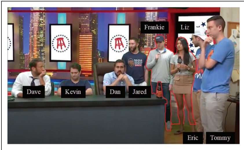
Figure 1. Configuration of panellists before the accusation 2 .