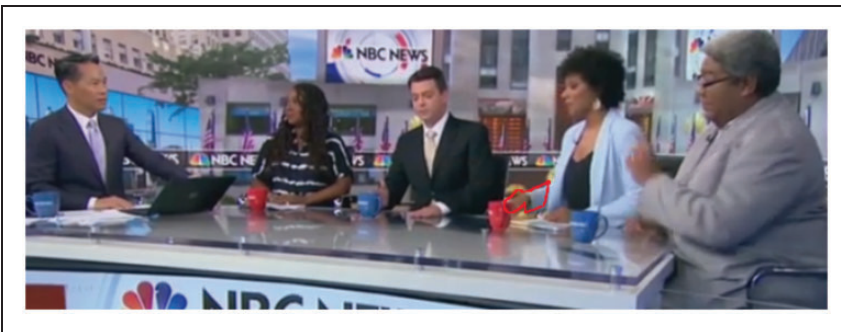
Figure 2b. Zerlina retracts her hand.