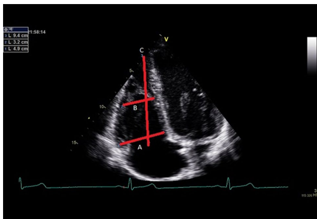
Fig. 2 RVD1 was obtained at the level of the tricuspid annulus, RVD2 at the level of the LV papillary muscles and RD3 was measured from the apex to the tricuspid annulus a =RVD1; b =RVD2; c =RVD3, Exemplar dimensions

tract allowing the assessment of the velocity time interval ( RVOT_{VTI} ) and identification of pulmonary valve closure (PVC), as the timing selected when the ascending side of pulmonary valve outflow trace reached baseline. Pulsed wave TDI was used to interrogate the RV lateral wall with a 2 mm sample volume positioned within the tricuspid annulus. Peak systolic (TDI-S'adj), early diastolic (TDI-E'adj) and late diastolic (TDI-A'adj) myocardial velocities were measured. RV: LV ratio was determined from basal measurements in the RV and LV taken from an apical 4 chamber view at end diastole (Popple et al. 2018). All chamber sizes were allometrically scaled to control for inter-individual differences in body surface area, according to the principles of geometric similarity (Batterham et al. 1999).