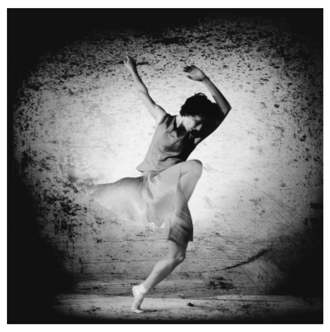
Figure 7: Richard Alston Dance Co., Red Run, 1988.

describes this idea, noting that the skill in dance photography is in making the image suggest more. But Ride notes that this is not just a case of the photograph working; the viewer must also have the imagination to look deeper into the picture and see what might be possible (Nash 1993, 8). Novelist and art critic John Berger also describes this lucidly: "An instant photographed can only acquire meaning insofar as the viewer can read into it a duration extending beyond itself. When we find a photograph meaningful we are lending it a past and a future" (McQuire 1988, 59).