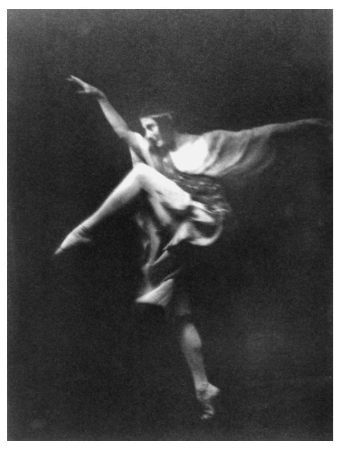
Figure 1: Anna Pavlova c. 1915.