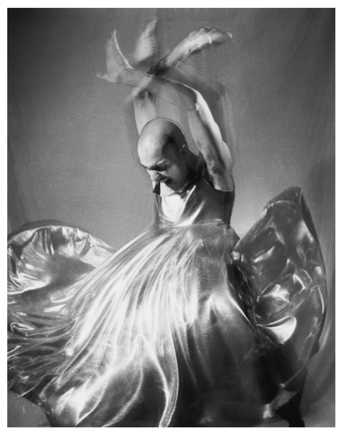
Figure 5: Javier de Frutos, The Place does not Forgive, 1995.