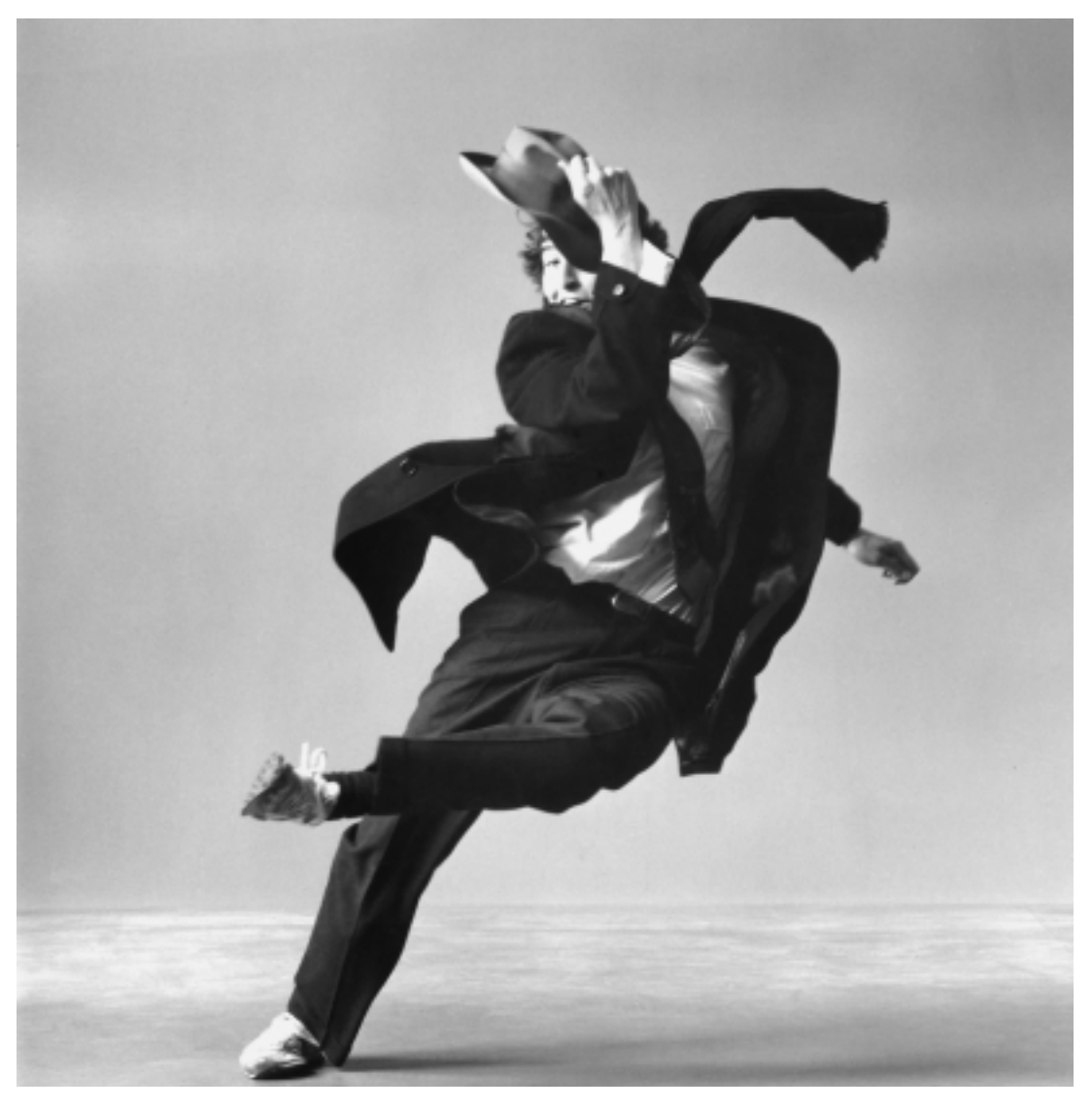
Figure 3: Daniel Ezralow 1982.

yond the photograph, the viewer expands the moment, adding narrative and movement to the stillness. Other Greenfield photographs manage to communicate movement in a similar fashion. One photograph features an unbalanced man, on one leg, falling to the side; here, the dancer's body shape, angle, and clothes indicate the movement. Again, the brief narrative of movement is there to be read into the picture (Fig. 3).