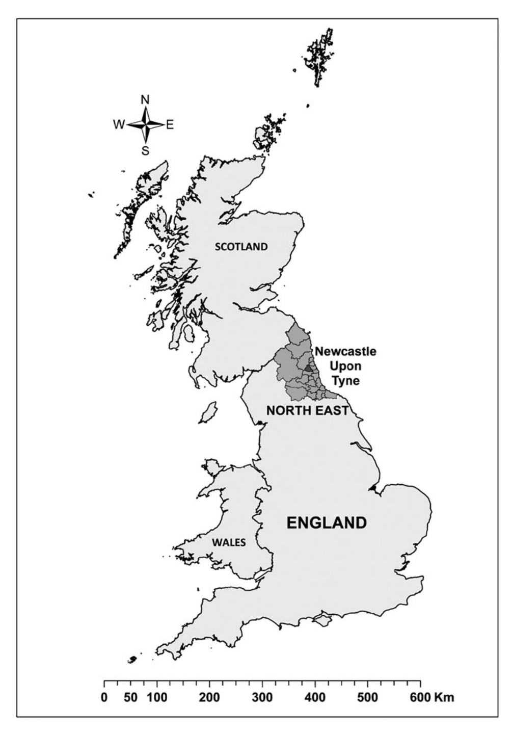
Figure 1. Map showing the location of the North East region of England.