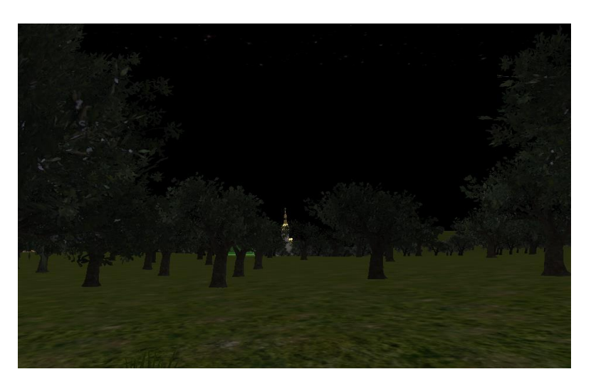
Figure 8. The distant church

As described in (fig. 7) Exploration was found to be the most prominent mechanic, with eight out of the nine participants mapping it against the remembering category of Blooms. In the context of the information provided by the quest givers i.e. 'go to point A, B, etc.' exploration seems closely tied to the remembering aspect of Bloom's taxonomy. It is noted that a number of participants headed for the visible spire of a distant church. On arrival, a quest giver informs them 'there is nothing here, please go away!' (Bloemhoff, 2013). Or as a player noted; 'Exploration is not rewarded, even though it is encouraged by points in the distance (the church)' (fig.8).