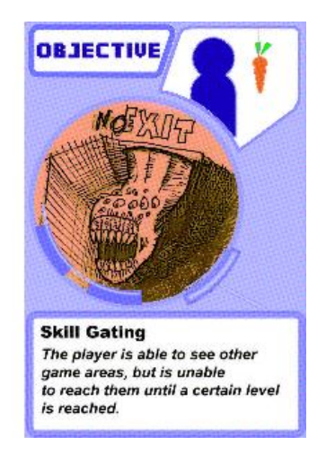
Figure 2. Example Game Mechanic cards

4. Example Case study – 'Important events in the life of Harriet Tubman':