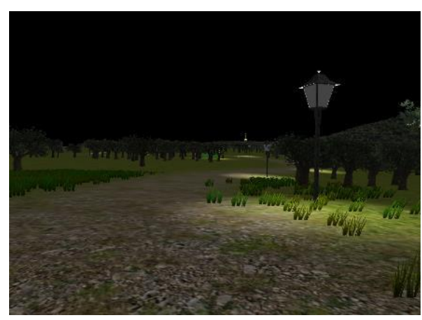
Figure 5. Enemy camp notification.