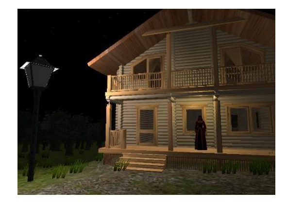
Figure 4. The first quest giver.