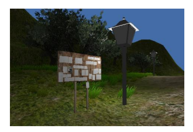
Figure 3. The noticeboard at the start of the game.

A description of the case specific game mechanisms within the context of the case study follows. These are presented as per the order of introduction within the game and shown in italics. The same mechanics are also specified within Table 1. The Primary game objective was to find the underground railway, and escape the area, as introduced via a notice board beside the player start position (fig. 3) other information, such as a map of Maryland was embedded within the loading screen, outlining the events and objectives in a historical context;