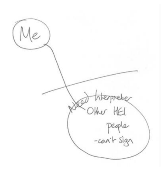
Figure 1. To show non-signing colleagues on eco-map

Other participants talked about the effort and emotional labour of working with those who could not sign. One participant spoke of their frustration when interacting with colleagues with only basic sign language skills –