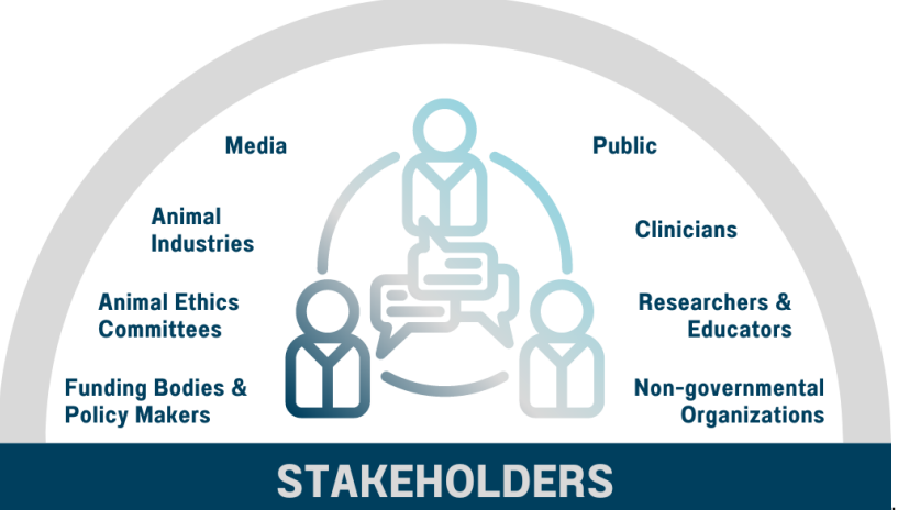
Fig. 1: Stakeholders in the use of animal methods, as identified by workshop participants

Researchers and publishers (including editors and reviewers) have already been widely mentioned as stakeholders in the use of animal methods, but the people carrying out this bias and those affected by it are not limited to these two groups. Participants identified other important actors like funding bodies, policy makers, companies in animal supply chains, as well as powerful and established industries using animals, the press and media, and the public (Fig. 1).