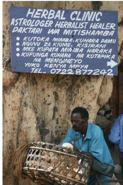
Figure 5. A coconut juice trader under a tree with a signboard detailing services of a traditional healer in Malindi, Kenya.

Kenyans continue to rely on traditional healers and witchcraft practitioners to treat illness and as a way to gain success at work and in relationships. 28