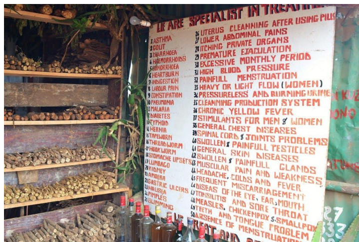
Figure 6. Street seller of herbal remedies in Nairobi.