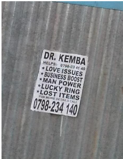
Figure 10. An advert attached to a wall.

Ordinary people in Nairobi have found creative and manipulative ways to shift the perception of witchcraft. Adverts are attached to walls, hand-painted signs hang from trees and homemade posters are pinned to telegraph poles. They line the main roads in and around Nairobi. Witchcraft has long been a commodity, one that is used by people to earn an income for themselves and their families. The language used to market their services acts as a bridge that crosses the divide between a place that classifies witches as evil and one where people are reportedly ‘chosen’ to be a witch by an ancestor or through ‘divine intervention’ (Wako 2019, n.p.). 52 Of course, divine intervention may come from either a deity of an African spiritual pantheon or from the Christian God. The implication is that the witch or practitioner has been given dispensation from a higher authority. It follows, therefore, that the term ‘divine’ is the practitioners’ unique selling point that