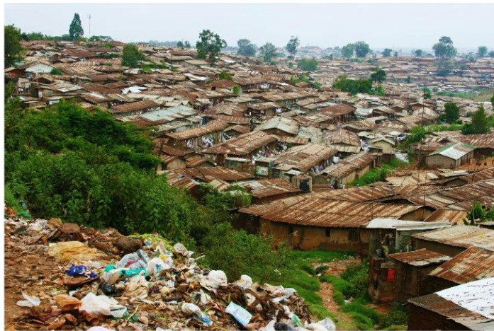
Figure 3. The slum of Kibera.

There may be similarities to be drawn from the fact that both the UK and Kenya are ostensibly democratic countries, with Christianity playing a significant role in the respective nations' societies and institutions, but any comparative analysis of experiences of misfortune and the role of African witchcraft – and any conclusions arising from it – needs to consider the significant differences between the two environments. The London research and analysis was conducted with this in mind, acknowledging that everyday life in London creates fundamentally different problems for the inhabitants to solve compared with those experienced by Africans in Kenya in their everyday world. This speaks to one of my major conclusions that one cannot take research conducted in Africa and simply overlay it on African communities in the UK when forming policies in the spheres of social care, education and mental health services.