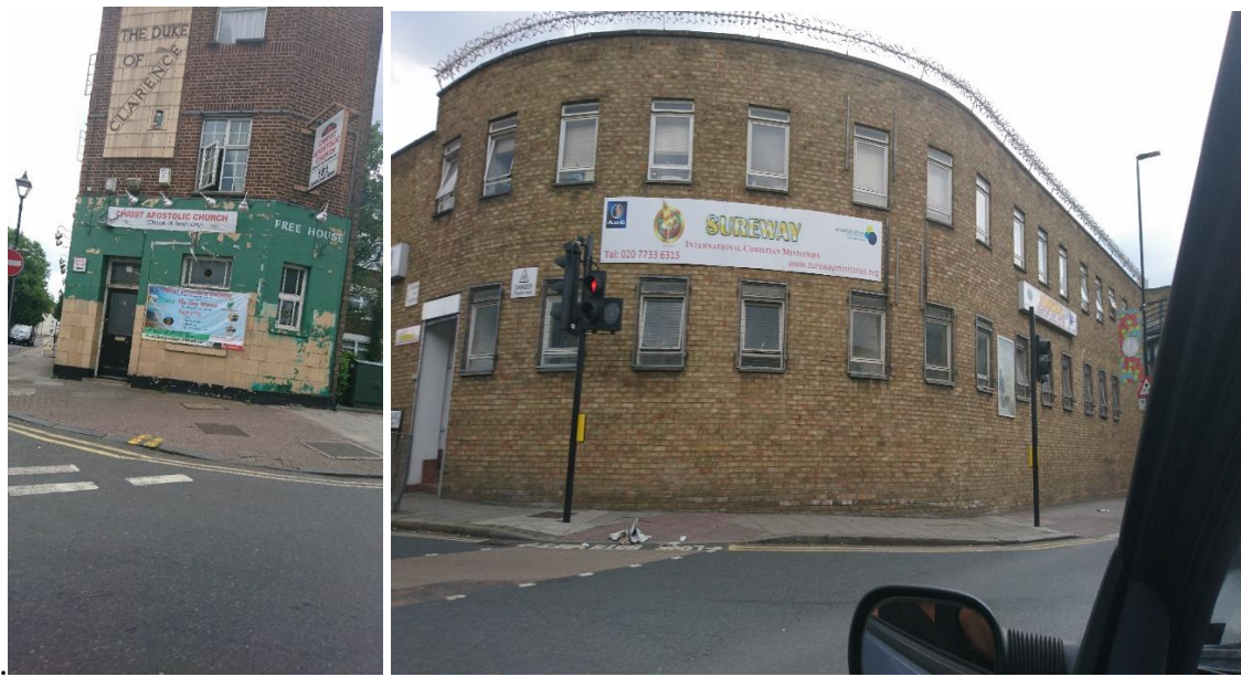
Figure 12. A high street church.