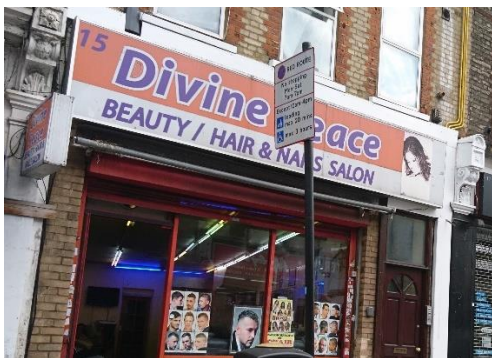
Figure 11. A storefront in London.

social aspects that religion and religious belief bring that shape people's lives by providing values and morals and denoting people's place within their religious communities and the wider society. One can often see the ichthus on the rear window of a passing car, declaring to others of the faith and non-Christians alike that the driver, or at least the owner of the car, is of the Christian faith. In Southeast London, signs in cars are common, particularly in places such as Peckham, or Little Lagos as it is known locally, where the people who attend the proliferation of AICs often display stickers in the rear windows of their cars or give their shops and bakeries names such as 'God's Blessings' and 'The Divine Right' (see Figure 11).