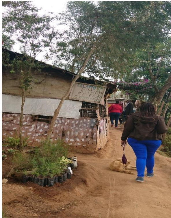
Figure 1. Sign advertising a self-help group.