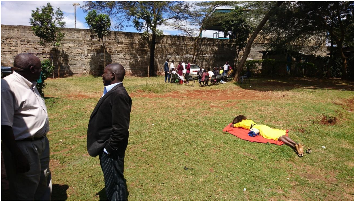
Figure 7. Grounds of the New Testament Church of God, Kawangware.