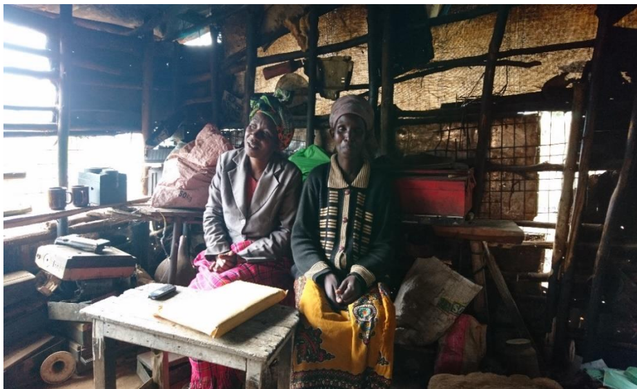
Figure 2. The ladies of the self-help group.

I did not find Black African Muslims in Nairobi who would engage in a conversation about witchcraft; therefore, regrettably, a source of potentially useful insight could not be factored in. It follows that similar Muslim communities in London also had to be excluded