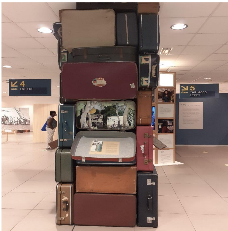
Figure 14. Suitcases stacked at the Museum of Migration.

The case studies in this section provide examples of what African people might encounter upon first arriving in the UK. Importantly, they show the spiritual and cultural resources they bring with them in their spiritual suitcase, which are used to bolster their properties of resistance, survival and expression and are employed in their attempt to integrate into a British way of life.