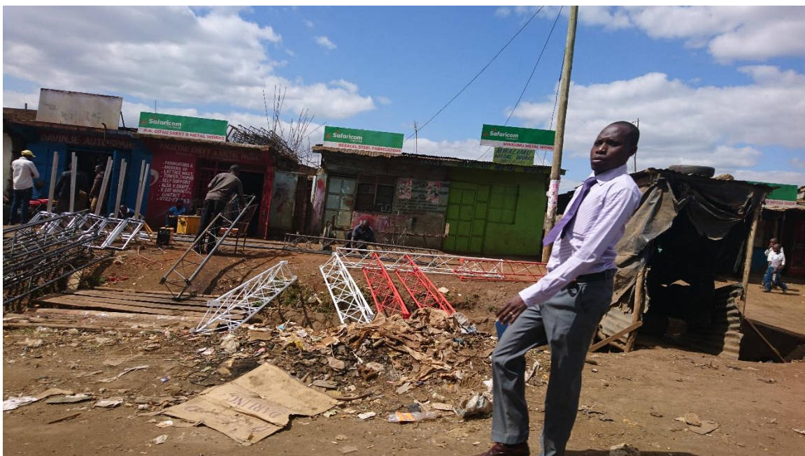
Figure 8. Sunday best in Kawangware.