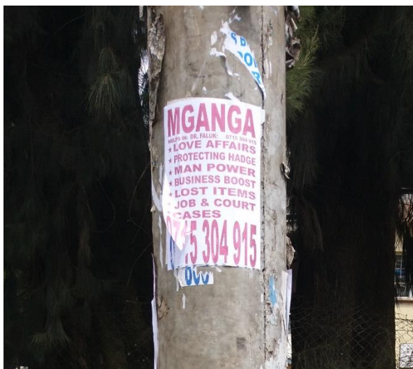
Figure 9. An advert pinned to a telegraph pole.

Through an exegesis of Kenyan life, using encounters with local people and their stories, it is evident that misfortune and the use of witchcraft to mitigate its effects is ingrained in many Kenyans' consciousnesses and is vital in modern-day Nairobi. Today, witches no longer hide (although they rarely use the term witch, preferring less emotive terms such as herbalist, doctor or soothsayer), advertising a plethora of services in plain sight (see Figures 9 and 10).