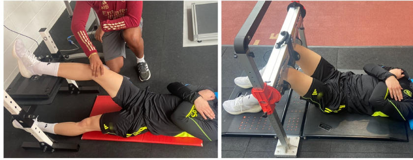
FIGURE 1 Standardisation of participant positioning for isometric posterior chain (left) and isometric hip abduction and adduction (right) strength testing.

remained in contact with the ground, under the plinth, for the duration of each test. For each test, players were instructed to push maximally, down into the force plate for 3 s, whilst keeping their buttocks, hips and head in contact with the ground and their arms fixed across their shoulders. Cueing for all testing was standardised as '3, 2, 1, push, push, push, relax'. All testing was conducted by the same experienced practitioner. Where a measurement error was observed (i.e., the buttocks, hips or head lifted from the ground, the non-testing heel lifted from the floor or the arms lifted away from the shoulders) data were omitted and the player was asked to perform another repetition.