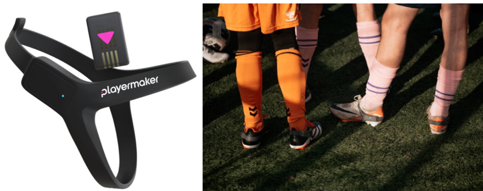
Fig. 1. Visual representation of the F-IMU silicone strap (left panel) and how this sits when mounted on the player's boot (right panel).

Before analysis, data were visually screened for normal distribution using Q-Q plots. All data is presented per player per 20-minute game as mean ± standard deviation (mean ± SD). This resulted in 615 individual player observations across both chronological (N = 327) and bio-banded (N = 288) formats. Injury and/or missing maturity data for a small number of players (N = 7) explain fewer observations in the bio-banding format. Partial least squares correlation analysis (PLSCA) was used to identify the relationships between the sets of variables (physical and technical characteristics) and explore which, if any, possessed the most relative importance to discriminate between formats. 38 A leave-one-variable-out approach was conducted to identify the change in inertia when each locomotor variable was omitted. 38,39 The count data were log-transformed to reduce skewness before analysis. The variables deemed to possess relative importance were determined by a visual break (i.e., the ‘elbow’) within the decrease in the singular value inertia plot (Supplementary Fig. 1).