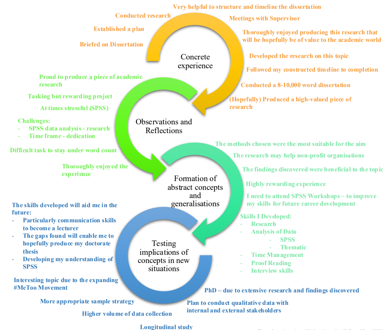
Figure 2: Authors Own (2018), Adapted by Kolb and Fry (1975).

A criticised of the model is that it lends itself to interpretation (Holman et al. 1997., cited in Bergsteiner, Avery and Neumann, 2010). Coffield et al. (2008) challenged Kolb as to whether his model represents four learning styles or four learning stages. The difference is fundamental since learning styles can be related to personality types, while learning stages refer to sequential steps in a learning cycle.