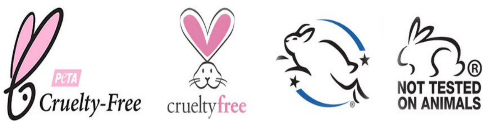
Figure 2: Cruelty-Free Logos (Adapted by Owens, 2022).