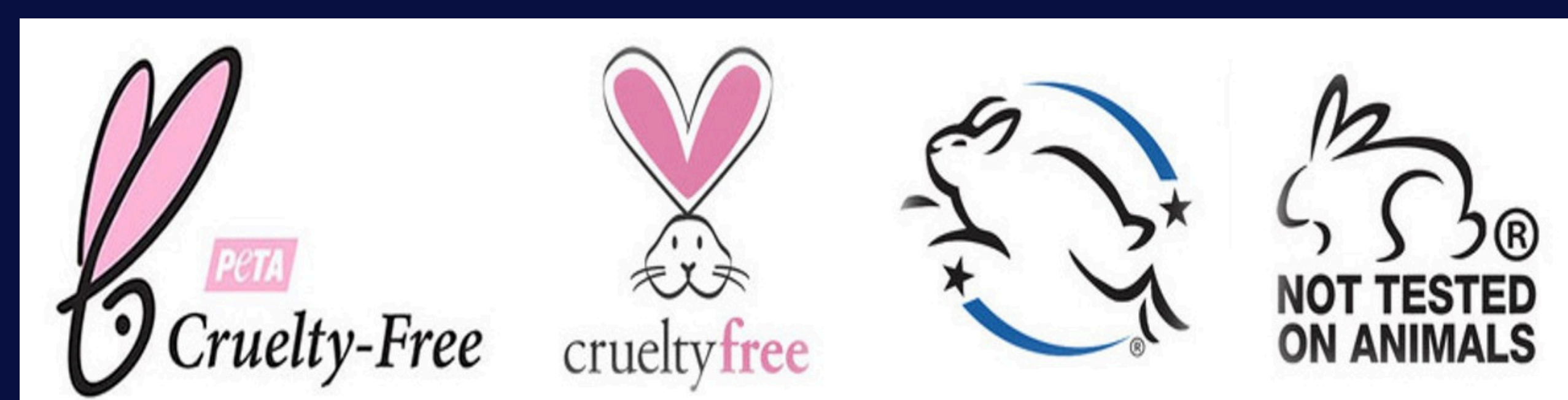
Figure 1: Cruelty-Free Logos (Adapted by Owens, 2022).

Cruelty-free means that no animals were harmed by the companies or suppliers in the creation of the final product (Cruelty Free International, 2023a). Due to legislation, companies also must declare whether they test on animals, given demand from the public and increased political momentum relating to such issues (Chitrakorn, 2016). A total of 3.06 million procedures were completed on animals in Great Britain in 2021 (UK Government, 2022; PETA, 2023). Out of the total number of procedures only 10% were required by law, the rest were conducted voluntarily (Cruelty Free International, 2023c). The animals typically used for the procedures are rabbits, guinea pigs, hamsters, rats, and mice (De Pauliny, 2021). It has been shown that non-animal methods in cosmetic testing have shown better results in predicting human responses in the real-world than the animal tests they replace (Humane Society International, 2023).