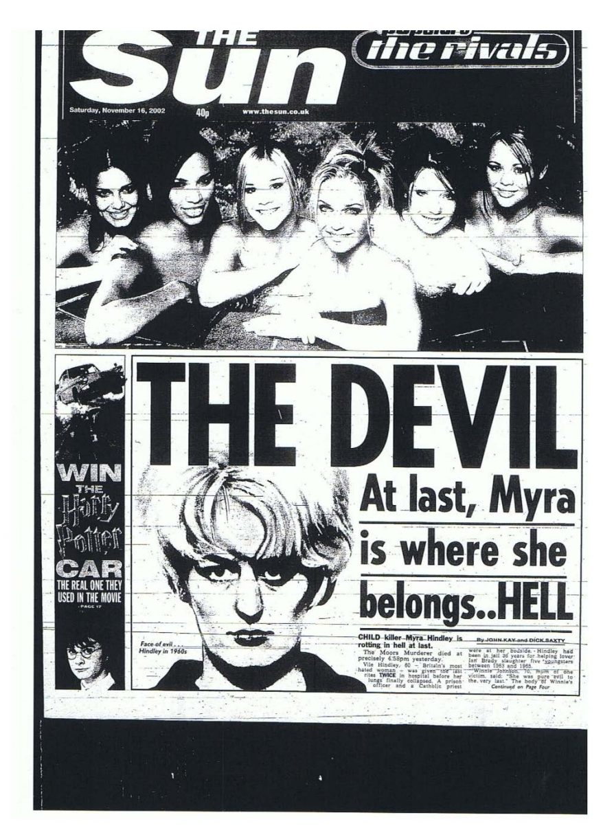
Fig. 4: The Sun's report of Myra Hindley's death (16 November 2002).

Carolyn Steedman and Allan Sekula have both cited the emergence of photographic representation in the mid-nineteenth century as fundamental to ways of looking at working class childhood. Steedman makes the link between the construction of working class childhood as "beauty in sordid surroundings, [ . . . ] an already thwarted possibility" (66) and the documentary photographic representations in which specific children were represented as such: "this literal depiction of working-class childhood was connected to the emergence of photography as a means of representation" (65). Sekula has noted how photography allowed