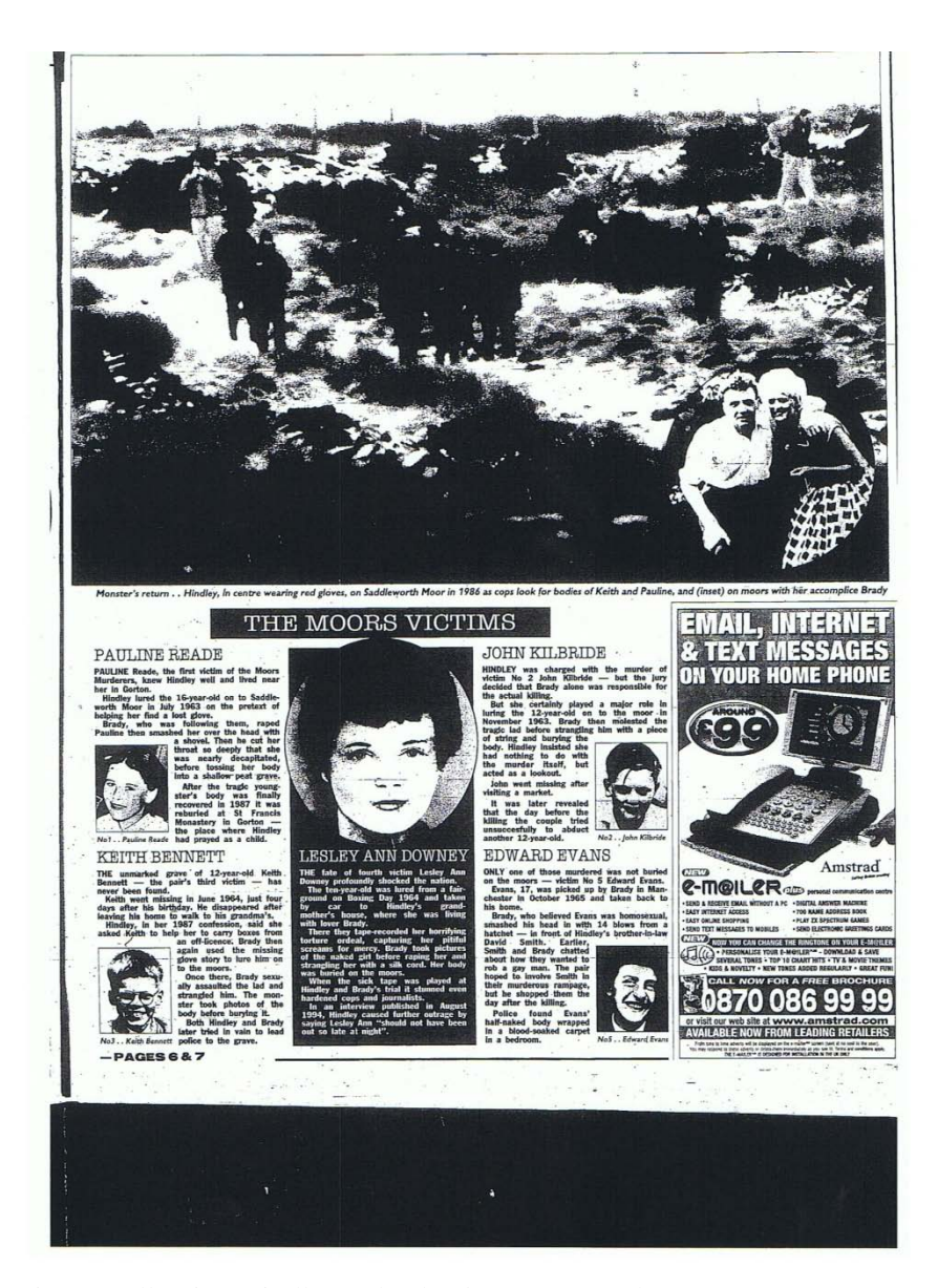
Fig. 5: Following Hindley's death The Sun remembers the narrative of the Moors Murders (16 November 2002).

the "honorific" function of painted portraiture "to proliferate downward" (345) allowing the poor to possess photographic likenesses of their loved ones. He cites how this has been viewed in terms of "the salutary effects of photography on working-class family life" (346). The photograph can be seen as evidence of the child as an object of love. Sekula argues that this honorific function operates in "a double system" (345) of representation, which is also