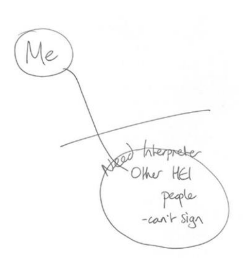
Figure 1. To show non-signing colleagues on eco-map

Other participants talked about the effort and emotional labour of working with those who could not sign. One participant spoke of their frustration when interacting with colleagues with only basic sign language skills –