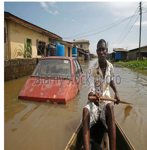
d) Canoe, alternative means of transportation during flood