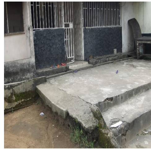
f) Self constructed drainage close to home entrance