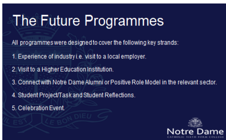
Figure 2: Future Programme - Design