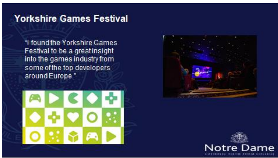
Figure 3: Future Programme – Yorkshire Games Festival