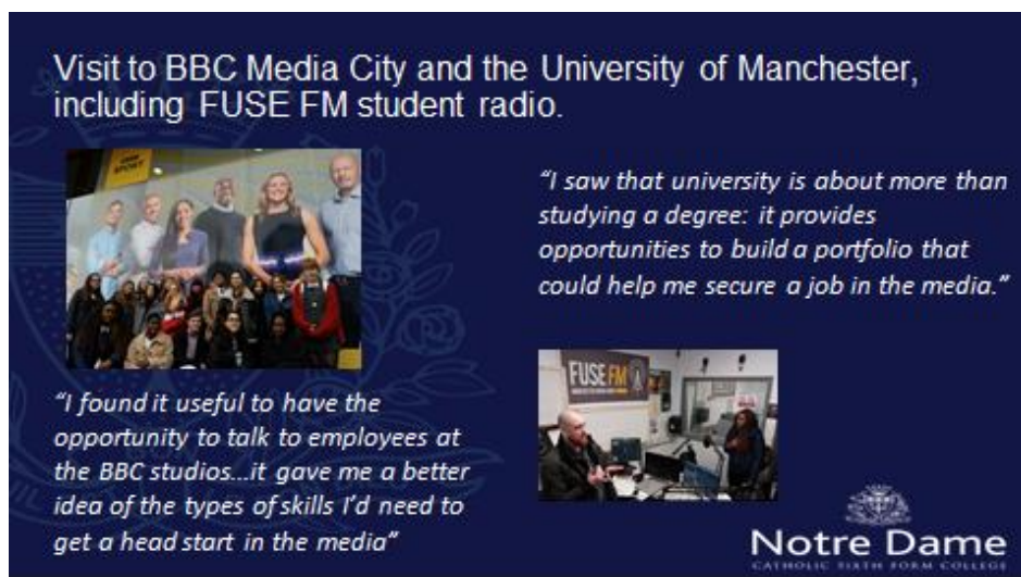
Figure 4: Future Programme – Visit to BBC Media City