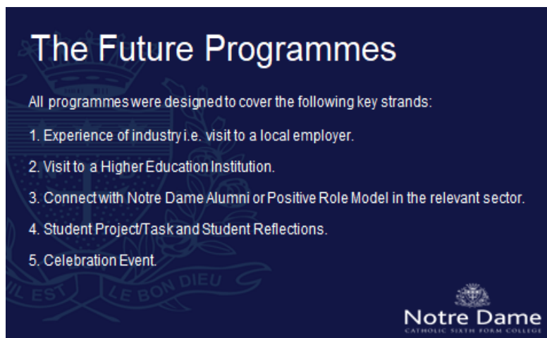
Figure 2: Future Programme - Design