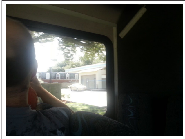
Figure 3. Material traces of water tide lines on gass station in New Orleans through tour bus window, authors own image.