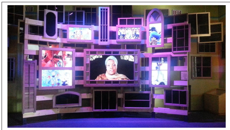
Figure 6. Still of community video installation. Living with Hurricanes: Katrina and Beyond , Louisiana State Museum, the Presbytère, New Orleans.

also includes references to the personal hardship of living without running water or electricity and the two feet of water that flooded the building. His resistance is perhaps best captured in his sense of loneliness and isolation. Taken together, the entries comprise a significant personal story of strength through the experiences and emotional responses to the disaster, a poignant and individual testament that exists alongside the narrative of communal hardship and hope.