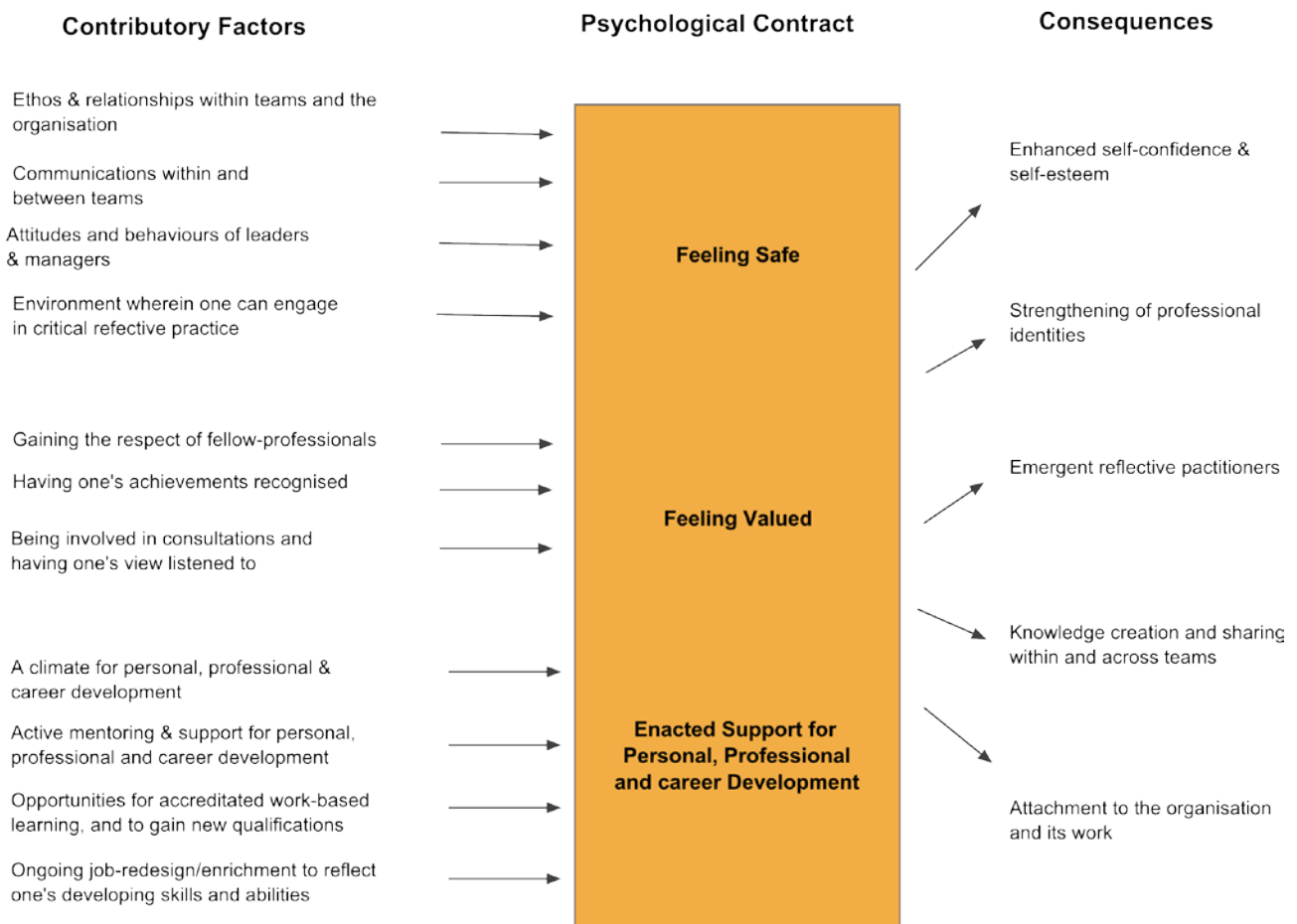
Figure 2 The ongoing process of psychological contracting and the changing individual-organisation relationship

Nowadays, it is commonplace for theorists and practitioners alike to claim that an organisation’s greatest resource is its people. The organisation’s future, it is suggested, is dependent in its willingness to nurture, build on and tap into people’s commitment and capacity to learn at all organisational levels and to embrace change (Senge, 1990). However, employee resistance to change has long been an issue of research interest, and a concern for leaders and managers. Commenting on this issue, King and Anderson assert: