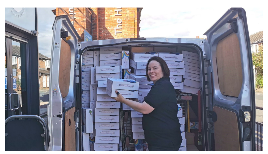
Loading the van with play packs: Theatre Hullabaloo

During the baby play chats several parents reported feelings and experiences of isolation and loneliness connected to having a baby during the pandemic. They talked about not being able to share their pregnancy with others, the closure of antenatal classes, baby groups and other in-person support groups, and not being able to introduce baby to extended family or family living abroad. For some, receiving the Baby Play Pack during this time made them feel 'thought about as lockdown parents.'