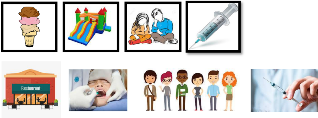
Fig. 3. Depictions of events used during the Hedonic Value Check with children (above) and adults (below) in Experiments 2a, 2b, 3a, and 3b. Stimuli depict the events described during the subsequent Temporal Preference trials.

future events were to take place “in the next 3 months.” Second, within each trial type, participants’ decisions to favor certain temporal preferences led to the presentation of additional questions. If participants demonstrated the expected temporal preference for pleasure in the future or for pain in the past on the first question (henceforth, “baseline question”), a second question was presented, preceded by the words “Something is different.” In this question, the person who had experienced the relevant event in the past had done so twice (e.g., “Clare ate two free meals in some of her favorite restaurants in the last 3 months”), whereas the person who would experience the event in the future would do so only once (e.g., “Daisy will eat one free meal at one of her favorite restaurants in the next 3 months”). If at this stage participants switched their temporal preference, the point at which they had made this trade-off between amount of pleasure/pain and its temporal location was recorded as being two events. They were then presented with the next Self trial type, which reverted to presenting a choice between one past and one future event.