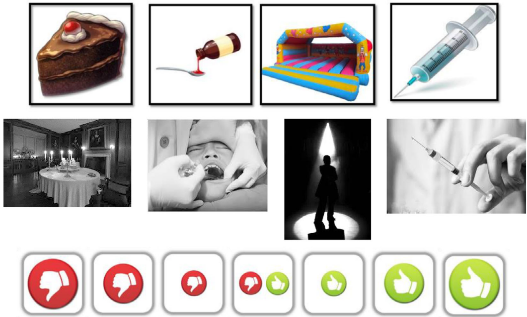
Fig. 1. Depictions of events used during the Hedonic Value Check with child (above) and adult (below) participants in Experiments 1a, 1b, and 1c, alongside the visual rating scale used with both child and adult participants. Stimuli depict the events described during the subsequent temporal preference and emotion prediction trials.

“This is Annie, and this is Betty. Both of them are fine now—they don’t have any pain. Annie had a painful injection yesterday, although she is not in pain today. Betty will have a painful injection tomorrow, although she is not in pain today.” Participants then responded to the preference question—“Who would you rather be? Annie, who had a painful injection yesterday, or Betty, who will have a painful injection tomorrow?”—by checking a box. Participants were then asked, “Why would you rather be that person?” and given two printed lines on which to give a free-text response.