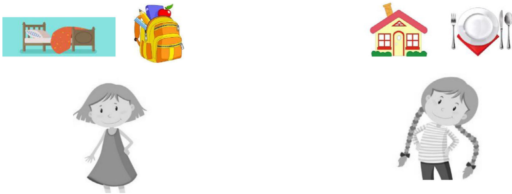
Fig. 2. Depictions of events used during the Pretraining task with 4- to 5-year-old participants, Experiment 1c.