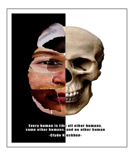
Figure 1. Winning student poster.

Our positive hidden curriculum offers an extracurricular framework for partnership with students to be change agents by demonstrating that they can influence events and their own living situations through participation (Luescher-Mamashela, 2013) – in a positive hidden (extra)curriculum. Students referred to their first encounters with a variety of diversity issues as a direct consequence of their review lens. This was education for education's sake (the positive hidden curriculum in action), in the spirit of citizenship and democratic equality, not a transactional, measurable output. Their comments highlighted an internalised desire to learn more, not simply report on the existence of this concept in their module. Such realisations pointed to 'intangible rewards' (Gourlay, 2015) inherent in our partnership, which has the potential to connect students and faculty from across disciplines as they engaged in the micro-activism.