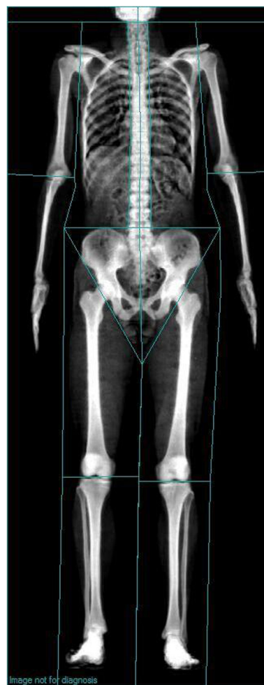
Fig. 2. GE Lunar iDXA total body less-head scan.

composition outcomes between the standard total body scan and the TBLH scan were determined using an independent T-test and significance was denoted at p < 0.05 .