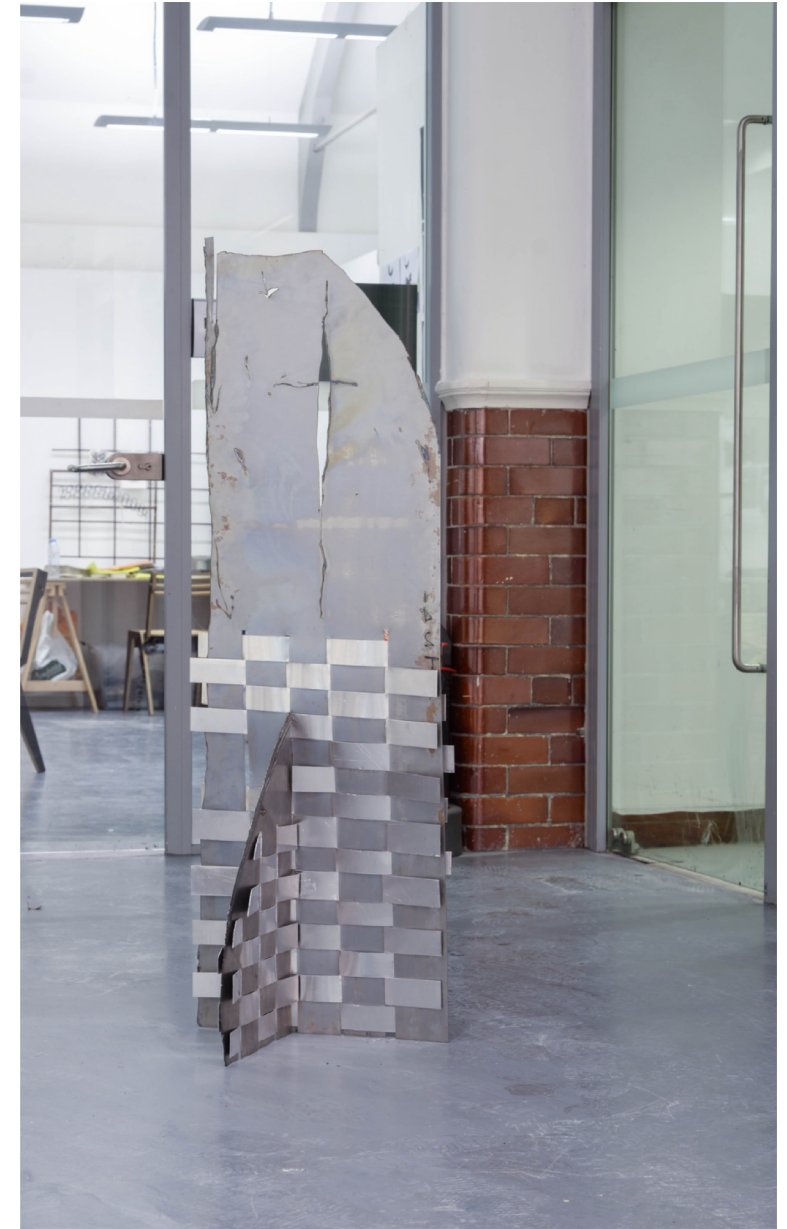
Study for a Shield after Battle (Forever) .2024 mild steel and aluminium