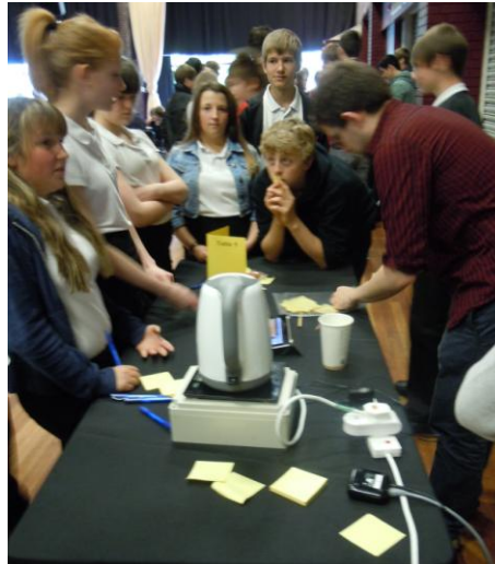
The 'stropky kettle'

For each prototype, teens watched a demonstration of the prototype by researchers. They then engaged in an exploratory use session wherein they were permitted to test the device and ask questions about it. They were then invited to provide written feedback to the designers of the devices. Showcases thus employed a range of widely-used product evaluation techniques including exploratory use, peer discussion and critique with the designer present, in order to provide a holistic understanding of the populations wants and desires in this domain.